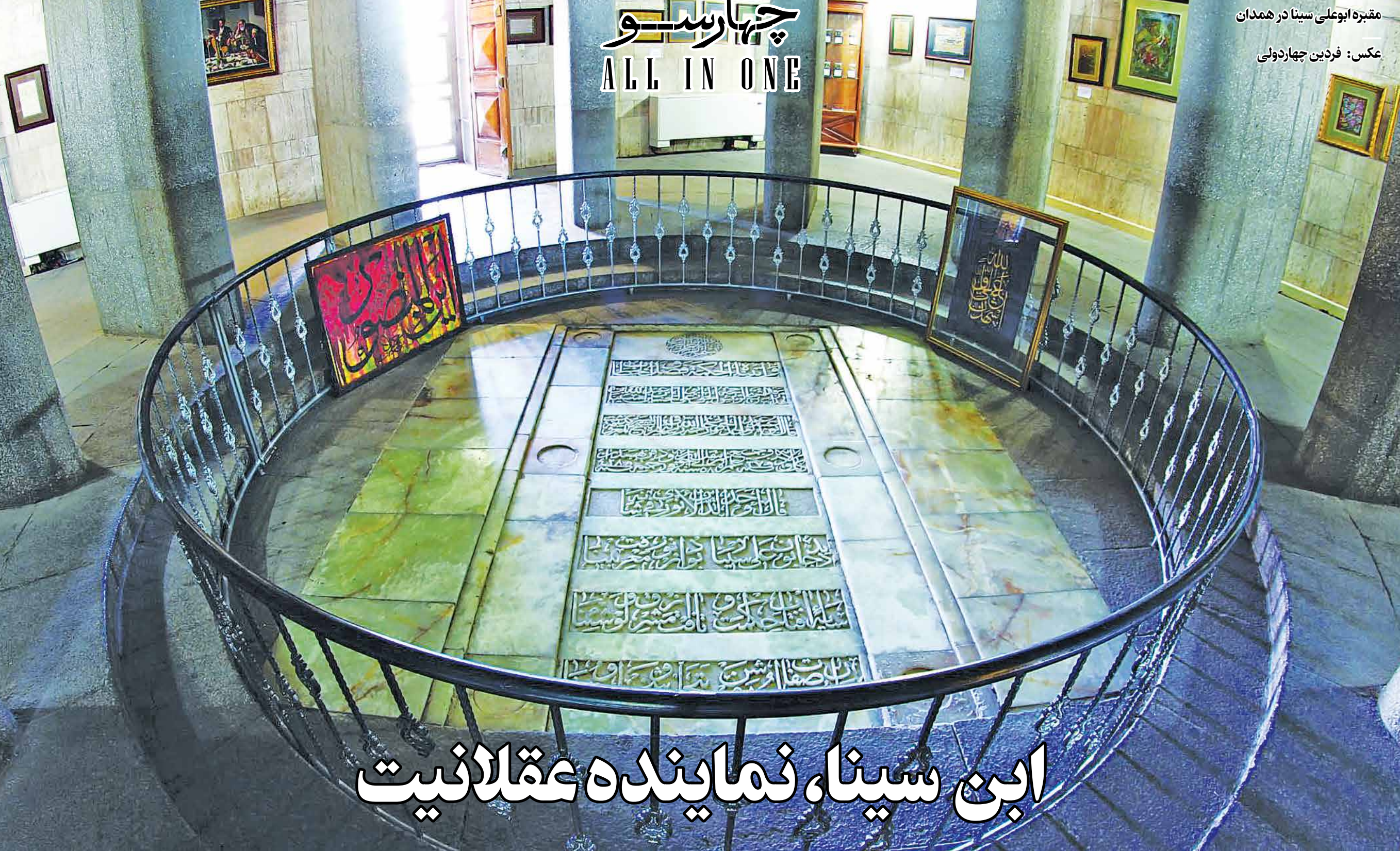
مقبره ابوعلی سینا در همدان

* شنبه ۲ تیر ۱۴۰۳ * ۱۵ ذی الحجه ۱۴۴۵ * ۲۲ زونن ۲۰۲۴ * سال نود و هشتم * شماره ۲۸۶۹۷